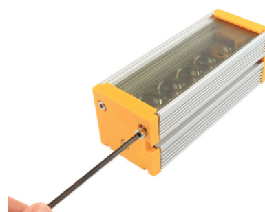
Close the product