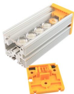
Open the ELBC and slide out the window