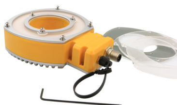
Open the ELRC