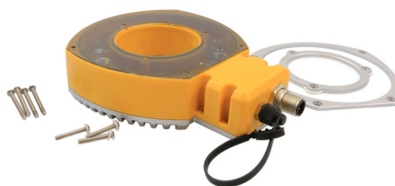
Place the polarizer on top of the window