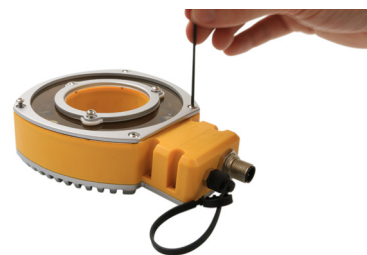
Close the product